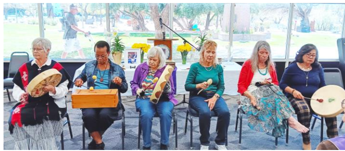
Some Temple ministers and members drumming at our April 7 th Sunday service.